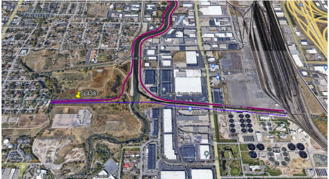
2) Project location map